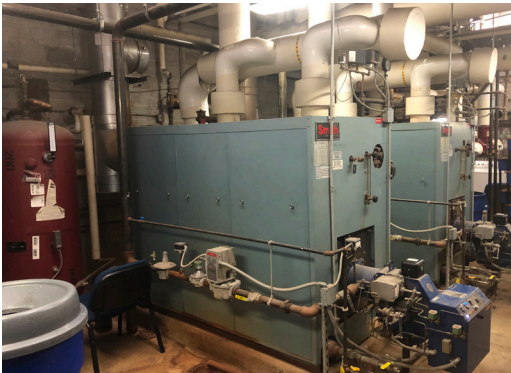
Replace 20-year-old steam boiler plant with hot water boilers