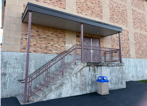
Stair and foundation restoration