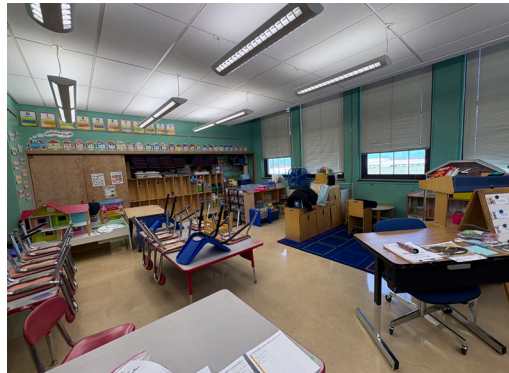
Floor and ceiling replacement to accommodate HVAC upgrades