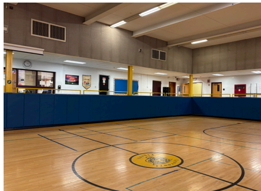
Refinish floor and update ceiling and lighting