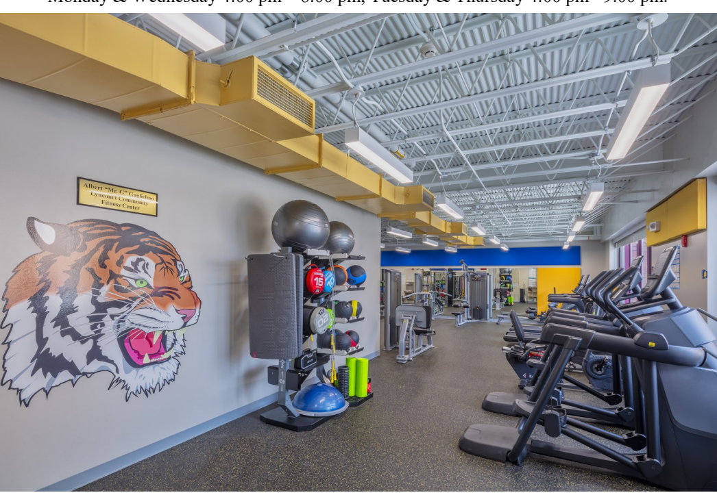
Great Expectations for Achievement, Respect, and Caring

Monday & Wednesday 4:00 pm -8:00 pm, Tuesday & Thursday 4:00 pm -9:00 pm.